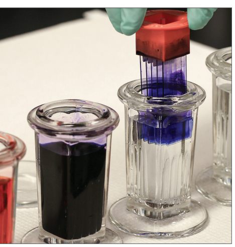
Dip 5–10 times to remove excess stain